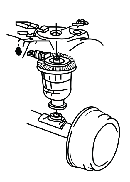
Step 1: Remove original Air Spring

Make sure you put the coil with the closer gaps looking up